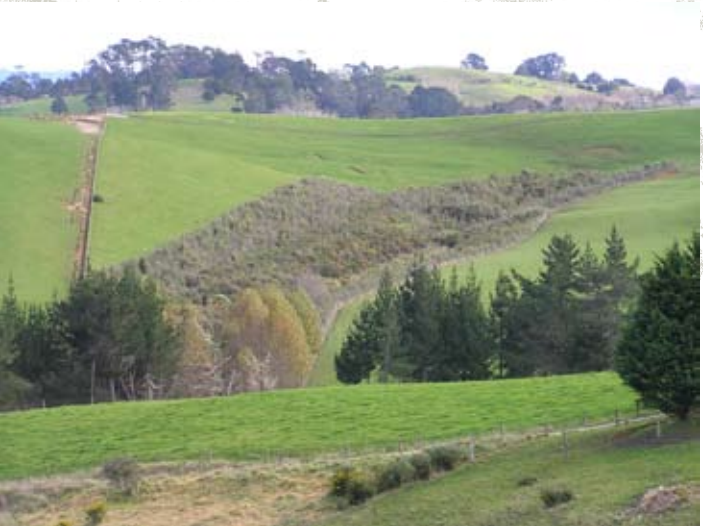
Trotter's farm after gully planting