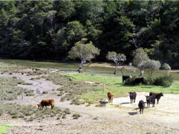
Schollum's mud flats before riparian planting