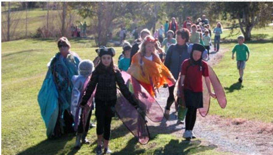
Magic Earth Theatre lead tree planting of Goodall Reserve