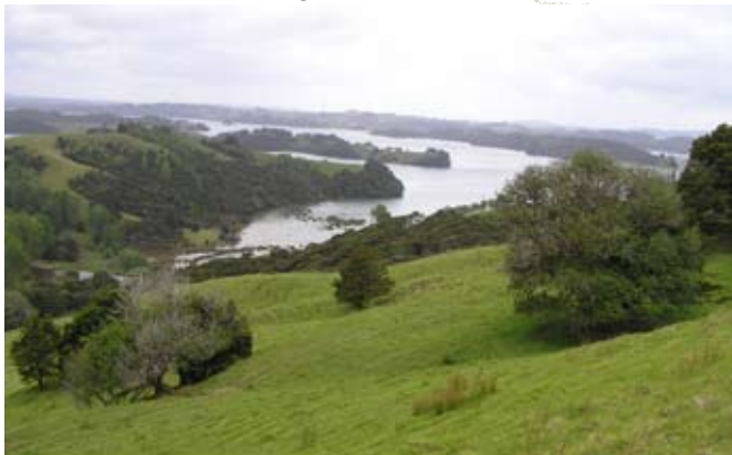
Mahurangi harbour from above Huawai Bay