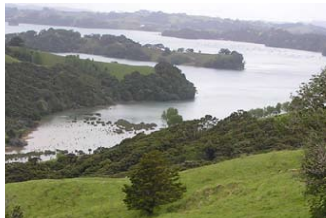
Mahurangi harbour from above Huawai Bay