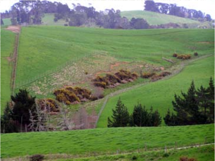
Trotter's farm before gully planting