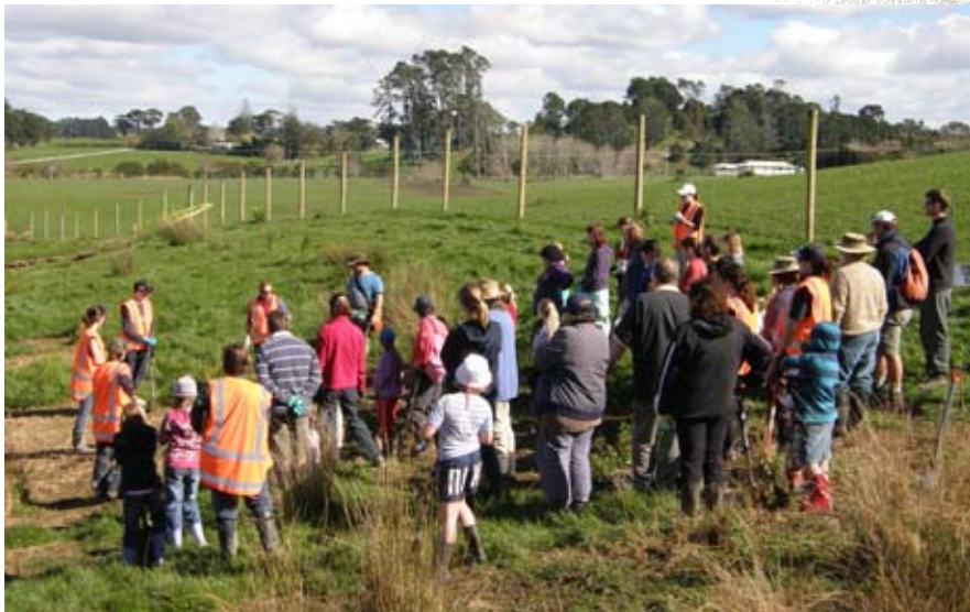
MAP Planting Day