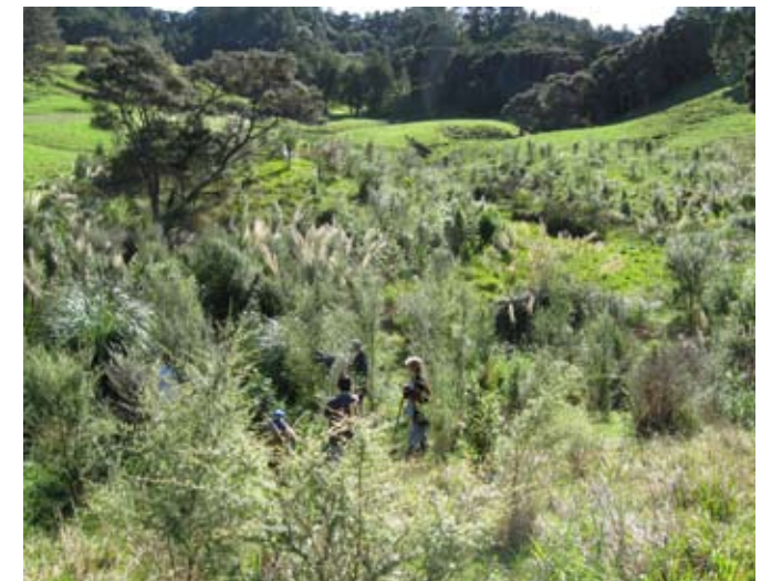
MAP 3 year old planting