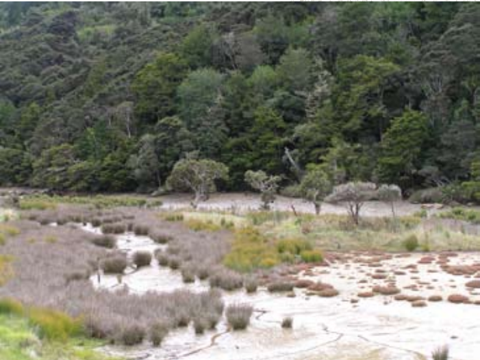
Schollum's mud flats after riparian planting