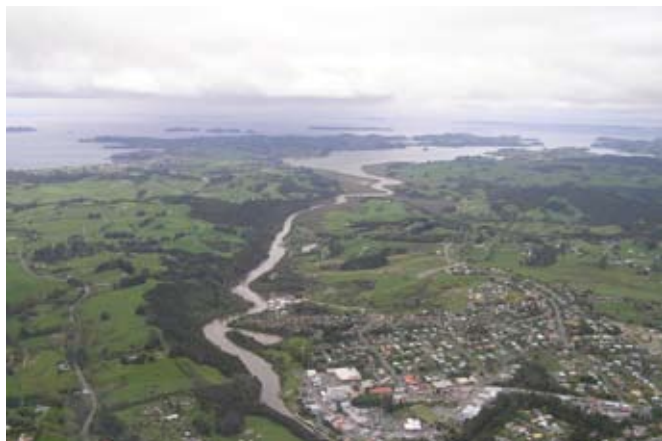
Warkworth and the Mahurangi