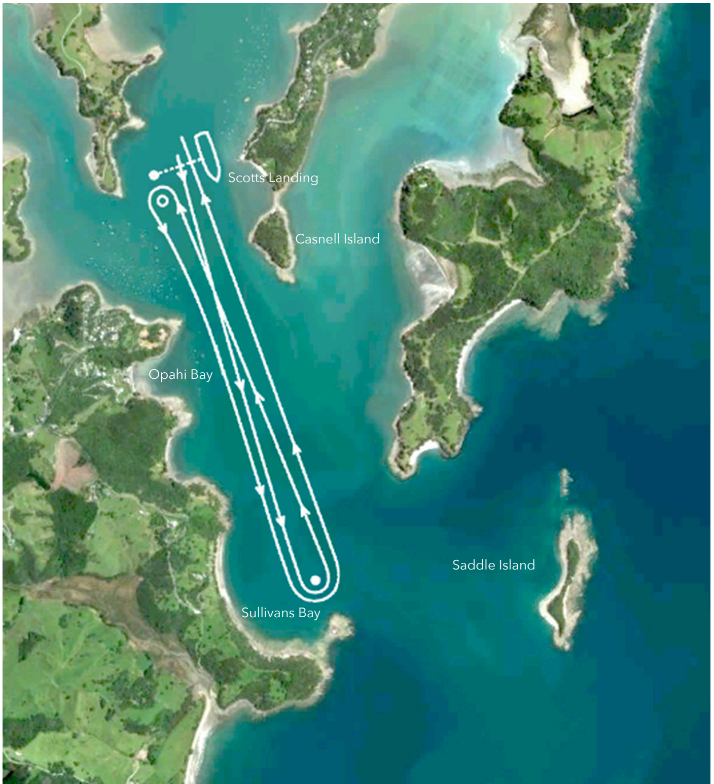
DIAGRAM ONLY. NOT TO BE USED FOR NAVIGATION. PLEASE CONSULT YOUR CHART

For Te Haupa, Frostbite, Mistral and Zephyr